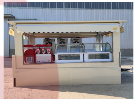
- Front -