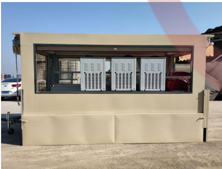
- Rear -