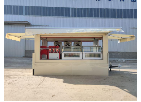
- Front -