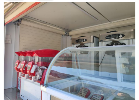
- Ice Cream Machines -