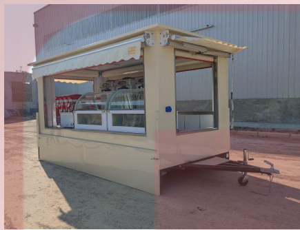
- Side -