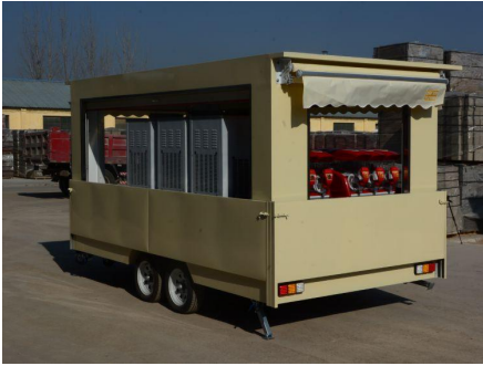
- Side -