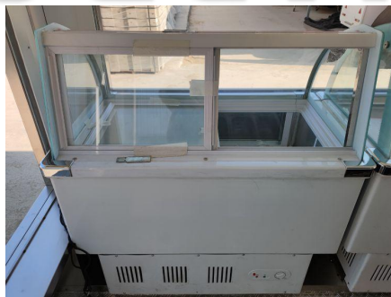
- Gelato Display -