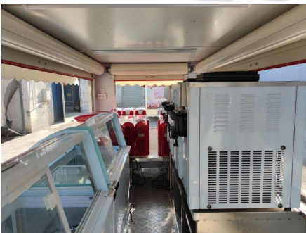
- Inside -