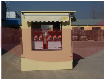
- Side -