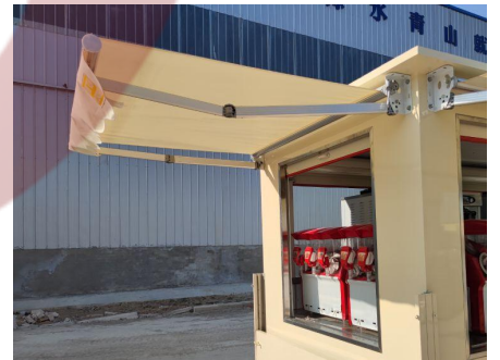
- Retractable Canopy -