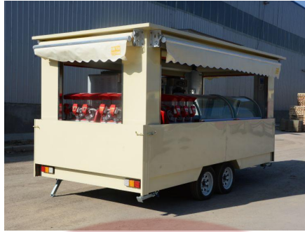
- Front -